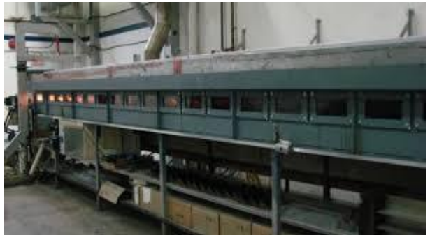
CAN/ULC S102 Test Apparatus

Because each wall assembly consists of several different materials in a unique orientation to each other, the IBC requires that each different type assembly be tested to NFPA 285. If an assembly, or even a component of the assembly is changed from a wall evaluated using NFPA 285, the assembly must be either tested or an equivalency analysis developed for submittal to the local building official.