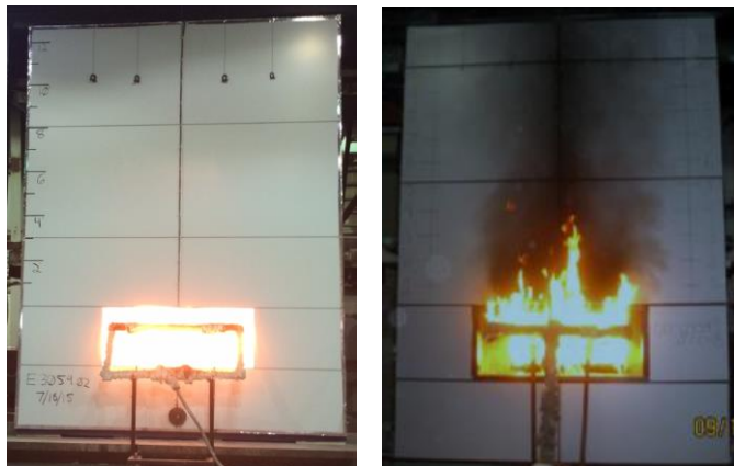
NFPA 285 Test Apparatus