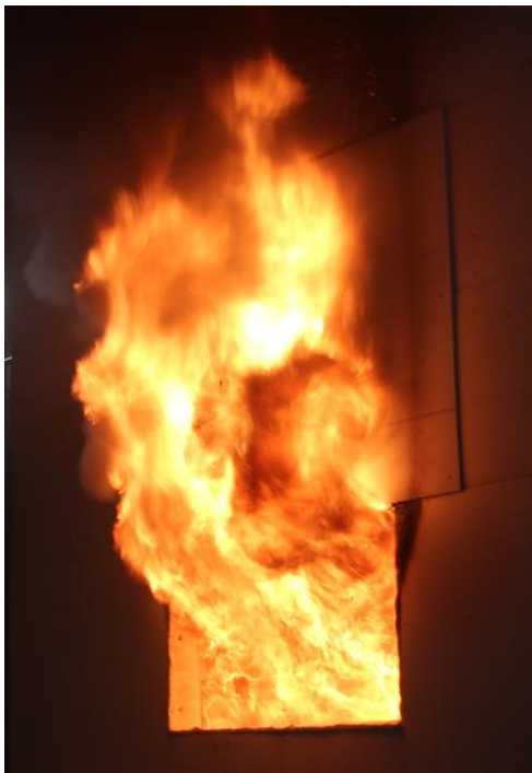
CAN/ULC S134 Test Apparatus